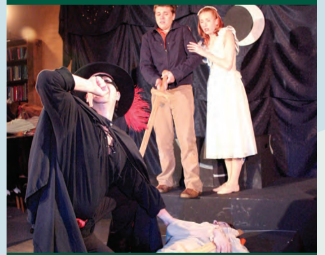
The Fantasticks Spring 2009