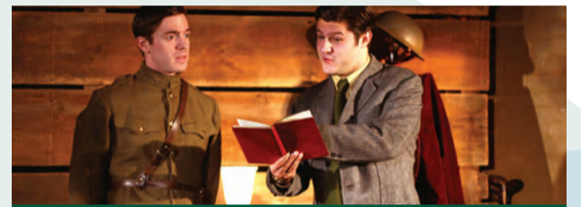
Not About Heroes Fall 2008

We are grateful to all of those who made our 2008-2009 season a success. With your help we were able to produce more plays and reach a larger audience than ever before. In our cozy library people witnessed the great biographical depiction of two WWI poets, Siegfried Sassoon and Wilfred Owen ( Not About Heroes ), a mother and daughter struggle with modern philosophical questions about the meaning and value of life ( 'night, Mother ), and also the first-ever musical in our library theatre (based on the myth of Pyramus and Thisbe, and the longest running off-broadway play, The Fantasticks ). Please watch your email or join our fan page at Facebook, Friends of Feltre, for an announcement of our 2009-2010 season. ♦♦